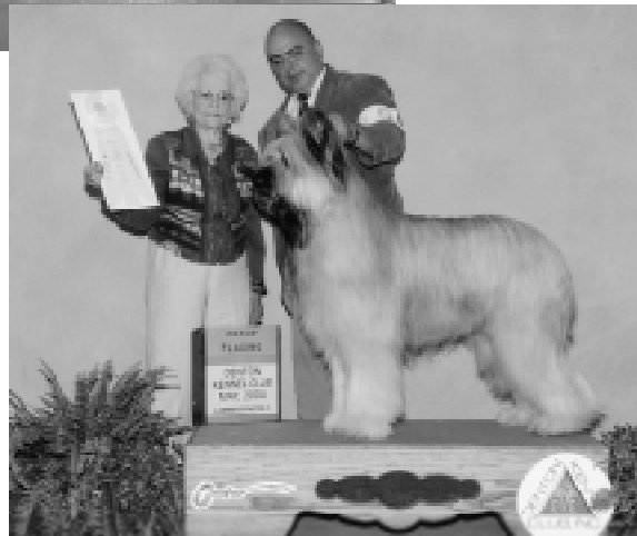
Ch Celebratia The Whole Enchilada

DENTON - "What I like are the BIG ribbons!," says Ancho (also know as Ch Celebratia The Whole Enchilada). "I got a big red and white one in Harrisburg and huge white one in Denton." Of course he means Best of Opposite Sex in a large supported entry in Harrisburg and a Group 4 in Denton. "The judge in Denton told me that she liked my expression. I liked hers too, especially when she was pointing to me!" Not known for his modesty, Ancho is now the proud father of pups. "I guess she decided on me after my Penn Hip evaluation came back so good," says Ancho. Yes, Ancho that must be it.